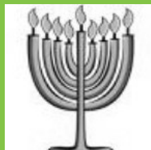
A Joyous Chanukah