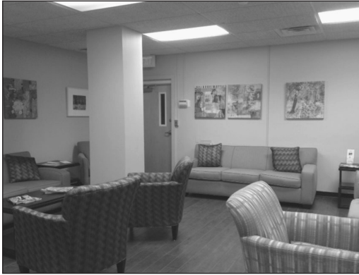
Domestic violence victims awaiting hearings in the courthouse now have a safe, dedicated place to go to avoid encountering those they have accused. The official, exciting opening was May 29, 2013.

National Council of Jewish Women Bergen County Section has been selected to receive the 2013 Citizen Community Achievement Award from the Bergen County Bar Foundation in recognition of our involvement at the Children's Court Care Center and the Domestic Violence Litigants Waiting Room. The award dinner will take place on October 3.