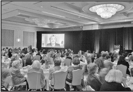
Convention attendees listen to Hillary Clinton.

Over 300 impressive, articulate, passionate women representing 42 sections attended the NCJW 47th National Convention in Atlanta, Georgia. Many were long-time NCJW members who held leadership positions in their sections. Others were newer members and/