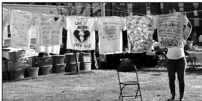
T-shirts being hung at the Clothesline Project.