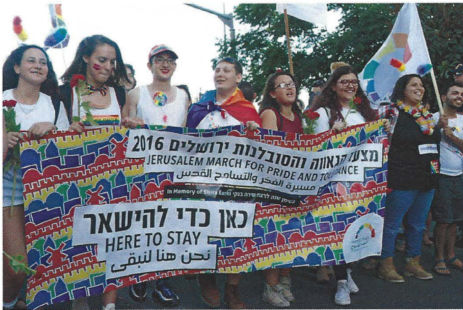
Jerusalem Open House Pride March 2016

NCJW Women and Gender Studies Program at Tel Aviv University (TAU): Development of an Alumni Association. In 2001, the first students were enrolled at the newly NCJW-endowed program at TAU. Now, NCJW is helping the program create its first alumni association. The network of graduates will support each other professionally, disseminate the fruits of their learning to the larger society, support scholarships and attract new students to the program.