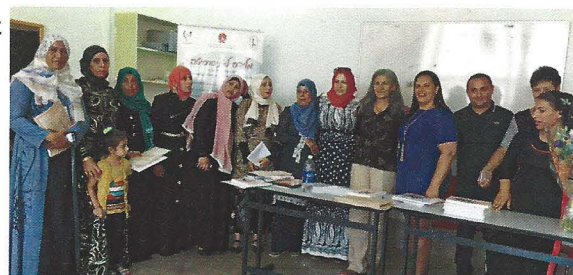
Members of RIFIE's class training Bedouin Israeli women for the workforce