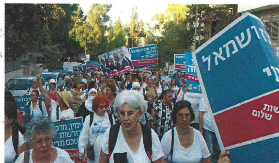
Women Wage Peace - March for Hope October 2016