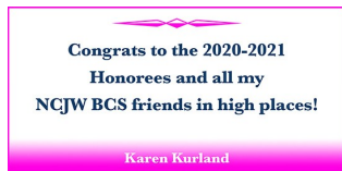
Half page (7.25 x 3.75)