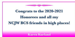
Half page (7.25 x 3.75)